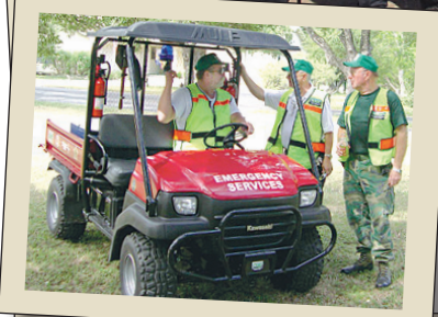
CERT members assist in searches, rescues, and emergencies